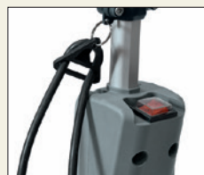
On/Off switch and cord support.