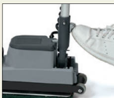
Foot-operated handle release lever.