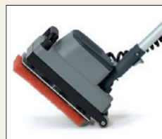
Two rear wheels for ease of transport.