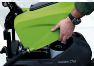
Extractable recovery tank

The recovery tank can be removed easily without tools to help the operations of emptying and to have easy access to internal components.