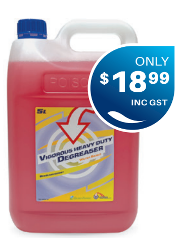
CCS Vigorous Heavy Duty Degreaser