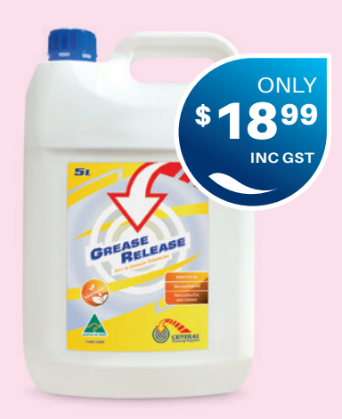
CCS Grease Release Degreaser