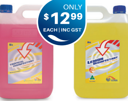
CCS Tropical Disinfectant

3 Ply, Non woven, Blue or Black Code: KSAMM50 | KSAMM50B