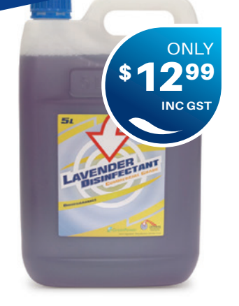
CCS Lavender Disinfectant