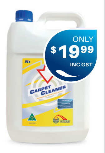
CCS Carpet Cleaner & Prespray