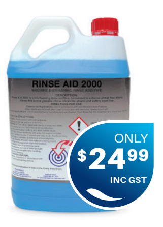
CCS Rinse Aid