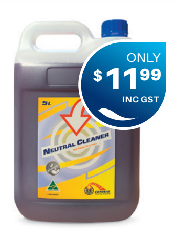
CCS Neutral Cleaner