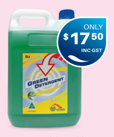
CCS Green Dishwashing Detergent