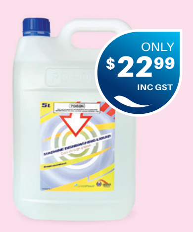
CCS Machine Dishwashing Liquid