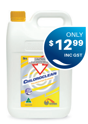
CCS Chloroclean Washroom Cleaner