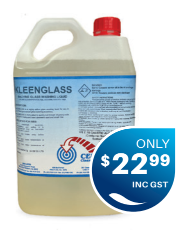
CCS Kleen Glass