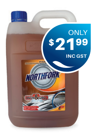
CCS Oven & Grill Cleaner 5L | Code: LOHC05