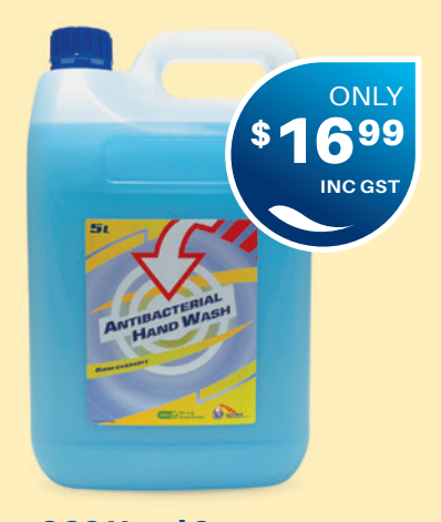
CCS Hand Soap Antibacterial