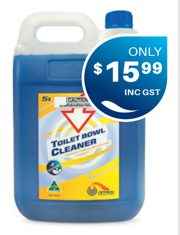
CCS Toilet Bowl Cleaner