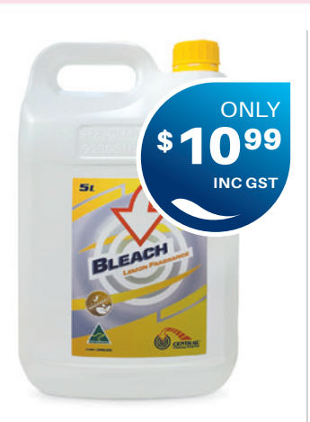
CCS Lemon Bleach