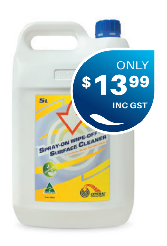
CCS Spray-On & Wipe Off Multi Purpose