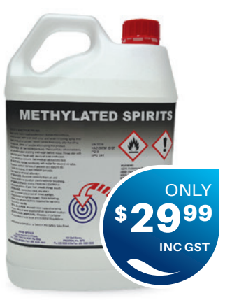
CCS Methylated Spirits 5L | Code: METH05