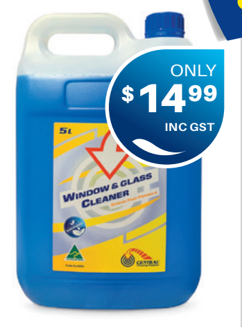
CCS Window & Glass Cleaner