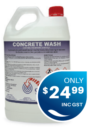
CCS Concrete Wash