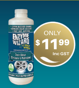
Enzyme Wizard Drain Odour Eliminator 1L Code: CEDO1L2