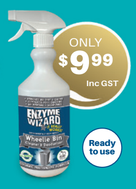
Enzyme Wizard Wheelie Bin Cleaner 750ML Code: CEWB750ML