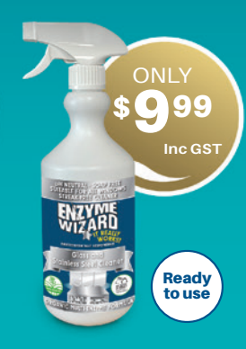
Enzyme Wizard Glass & Stainless Steel Cleaner 750ML Code: CFGS750MI