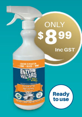
Enzyme Wizard Carpet Spot Remover 750ML Code: CECS750ML2