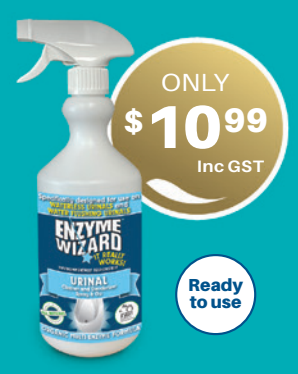
Enzyme Wizard Urinal Waterless Cleaner Spray 750ML Code: CEUD750ML