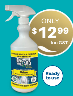
Enzyme Wizard Urine Cleaner 750ML Code: CEUC750ML2