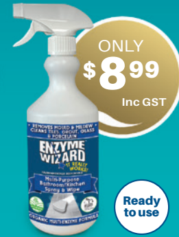
Multi-Purpose Bathroom/Kitchen Spray & Wipe 750ml Code: CEMM750ML