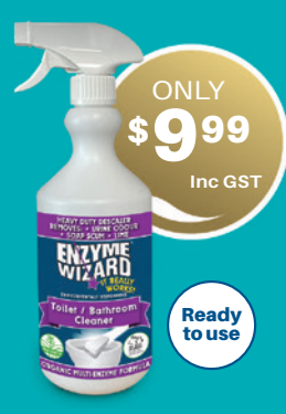
Enzyme Wizard Toilet Bowl Cleaner 750ML Code: CETB750ML