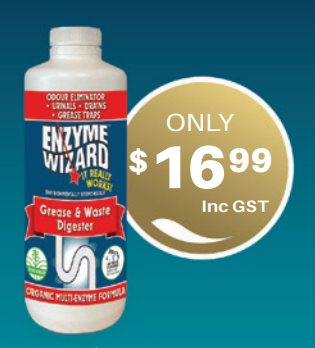
Enzyme Wizard Grease & Waste Digester 1L Code: CEGW1L2