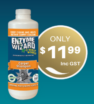
Enzyme Wizard Carpet Shampoo 1L Code: CECS1LS2