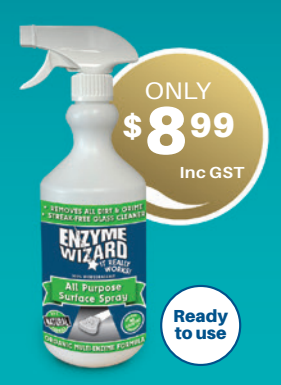
Enzyme Wizard Surface Spray 750ML Code: CESS750ML