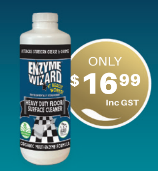
Enzyme Wizard Heavy Duty Floor Cleaner 1L Code: CEHD1L2